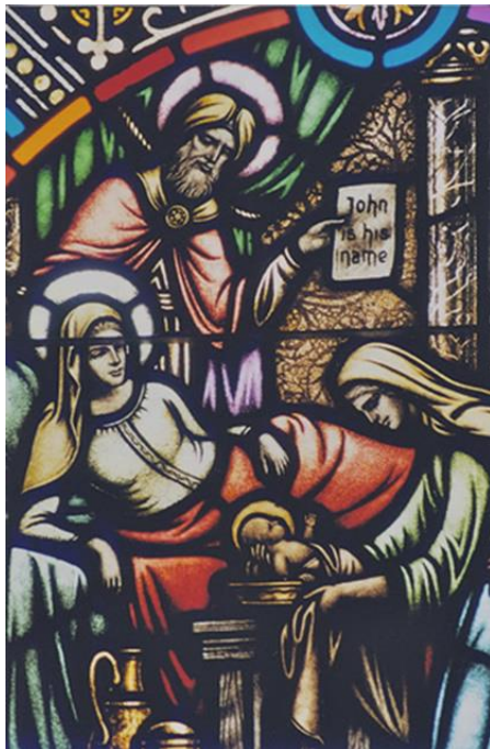
The Birth of John the Baptist

(everyone joins in with the text in BOLD )